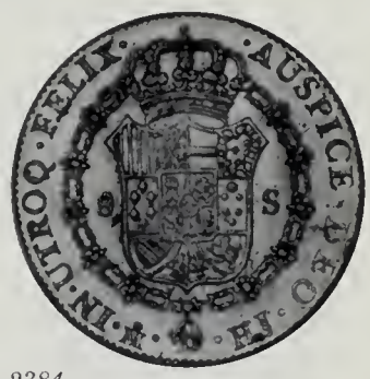
Lot No. 2384

8 Escudos, 1810 Mo-HJ. 1st Type. Obv. Imaginary armored and peruked Mexico bust. Rv. Crowned Arms within the Fleece Collar, IN UTROQ FELIX AUSPICE DEO around. C-T 39, Fr.47. The obverse is fully prooflike, with cameo contrast. The reverse is mostly prooflike, except in the center. A really stunning specimen and a splendid example of its type. Slightest cabinet friction. Virtually Uncirculated and choice. (2,500-3,000)